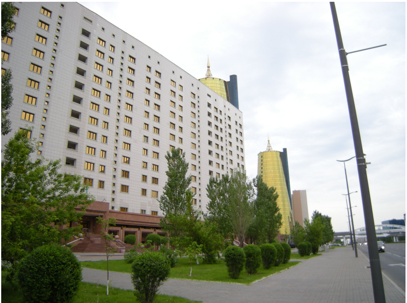
Building that is home to the Kazakh NSI, the Committee on Statistics, in Astana