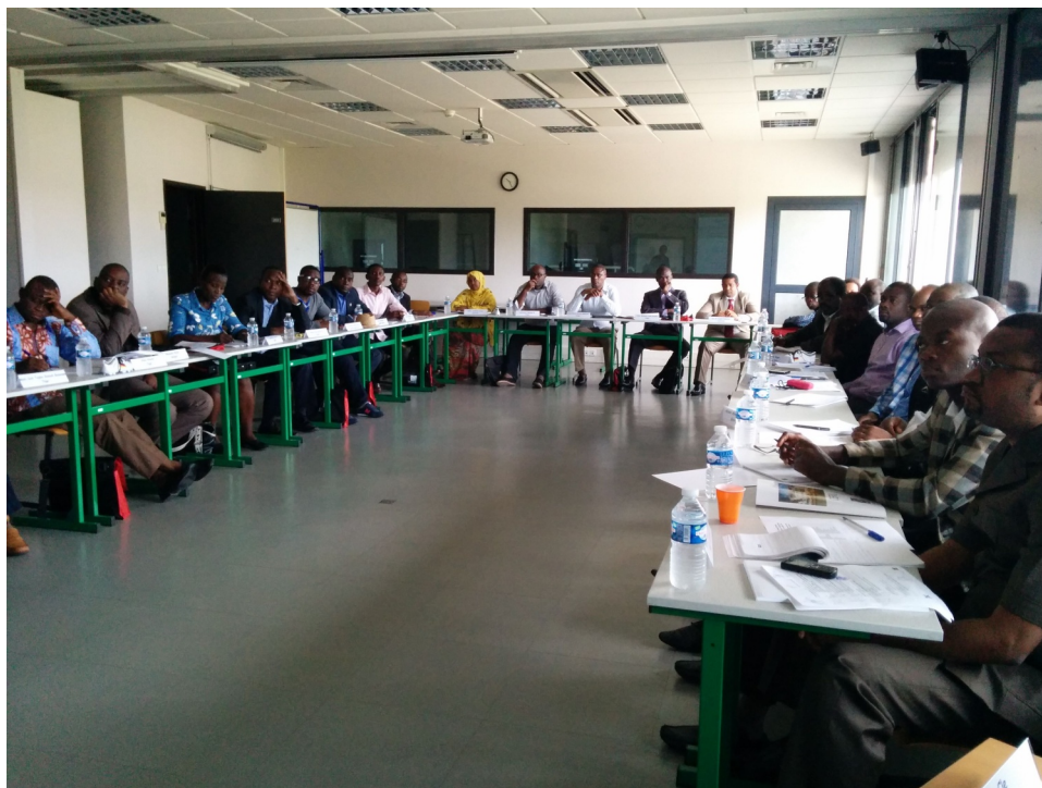
Seminar on short-term indicators co-organised by INSEE and AFRISTAT in Libourne

The programme had been very successful in 2013, and so at the request of Afristat, it was repeated in 2014.