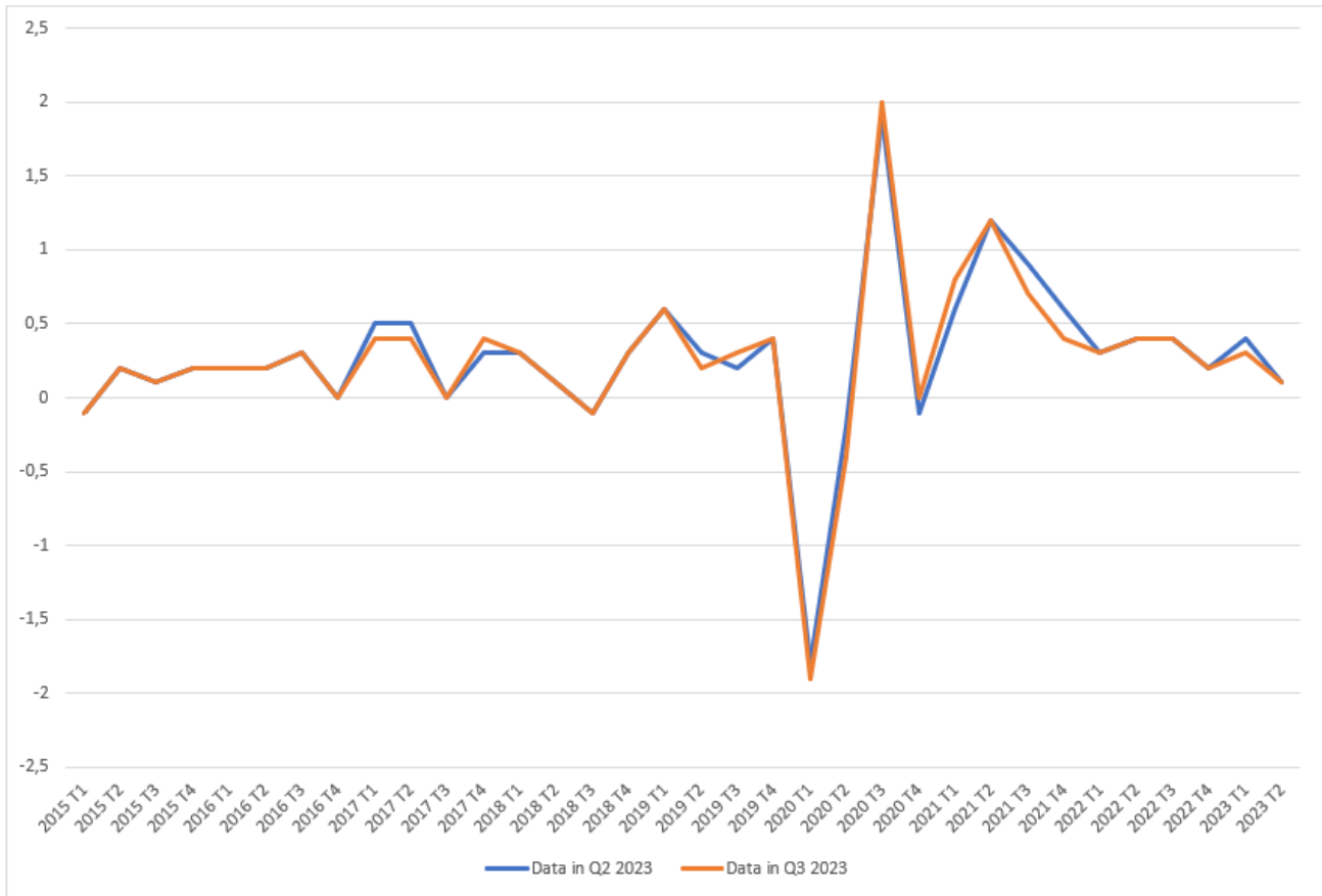
Figure 2. Evolution of payroll employment in quarters (in %)